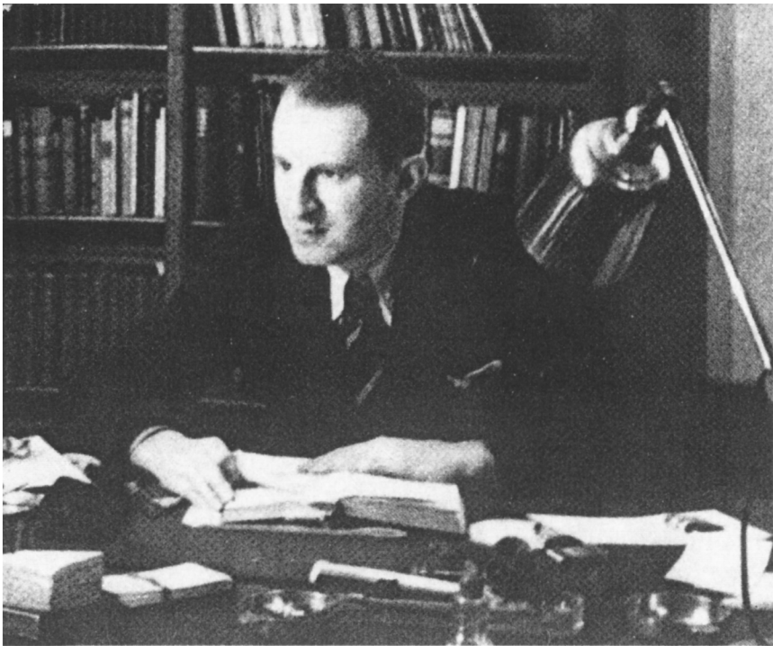
Marcuse, c. 1935